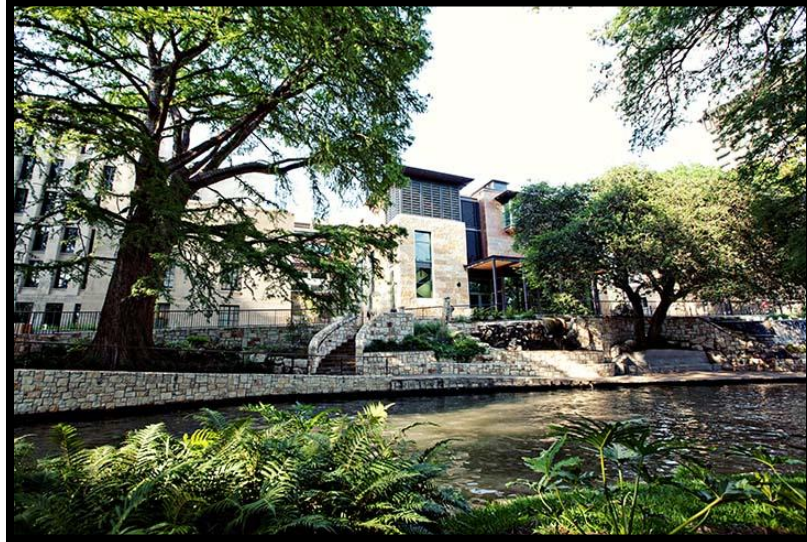
The Briscoe Western Art Museum and the Jack Guenther Pavilion are located on San Antonio’s iconic River Walk.

The Briscoe Museum is located at 210 W. Market Street in downtown San Antonio, Texas.