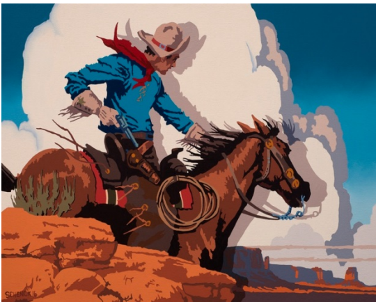
Billy Schenck, Study for Double Cross , Oil on canvas