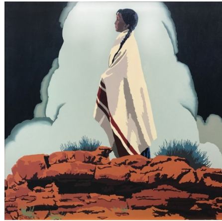
Billy Schenck, A Rocky Trail , Oil on canvas