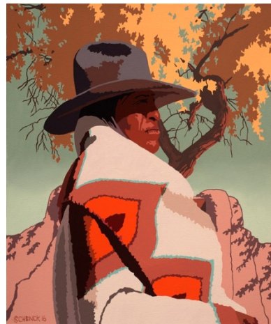
Billy Schenck, The Old Mission Gate , Oil on canvas