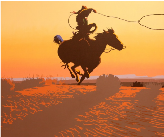
Billy Schenck, Throwin' A Loop , Oil on canvas